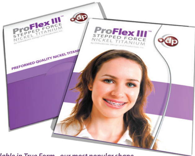
Available in True Form - our most popular shape.